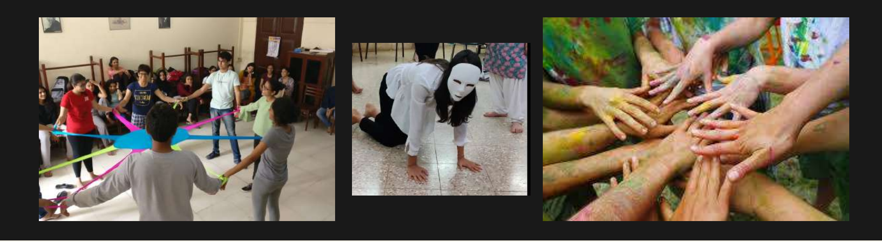
P.G. Diploma Expressive Arts Therapy www.xaviers.edu

The department has partnered with organisations to provide internships to our students as required by the fieldwork component. You graduate as an Expressive Arts Therapy Practitioner (ExAT-P). To be a Therapist you need a Master's in this field.